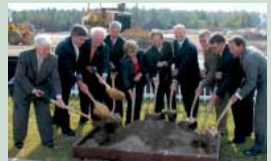
Lockheed Martin joins city and company representatives at its groundbreaking in 2003.