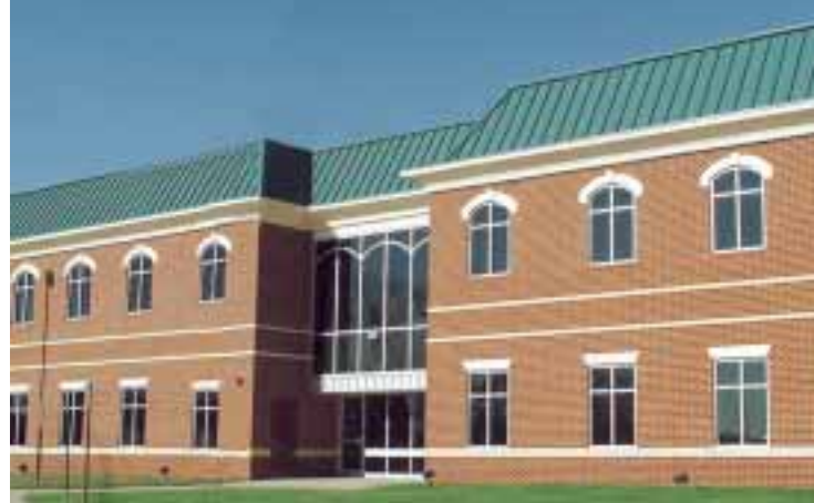
Rose & Womble's new facility will house its new homes division, marketing department, an affiliated mortgage center, legal offices and a resale office center.