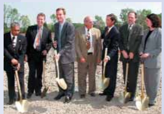
Governor Mark R. Warner (third from left) joins city and company representatives at the Target groundbreaking in April 2002.

Target Stores currently operate 1,081 stores in 47 states nationwide. Target Corporation typically gives more than $2 million a week to its local communities through grants and special programs. Since its inception, it has partnered with nonprofit organizations, guests and team members to help meet a variety of community needs.