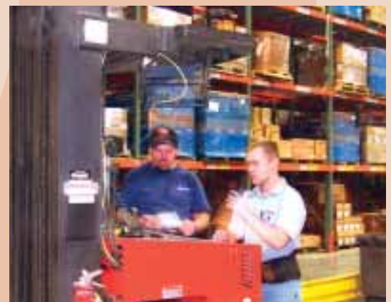
Ferguson Enterprises, Inc. invested $5.4 million in the new 64,000-square-foot regional distribution center and sales office in Northgate Commerce Park.

Northgate Commerce Park, located at Shoulders Hill Road and Nansemond Parkway, just west of I-664, is a master-planned regional commerce park for new and expanding businesses. At full development, it will encompass almost 500 acres, with sites ranging from three acres and up.