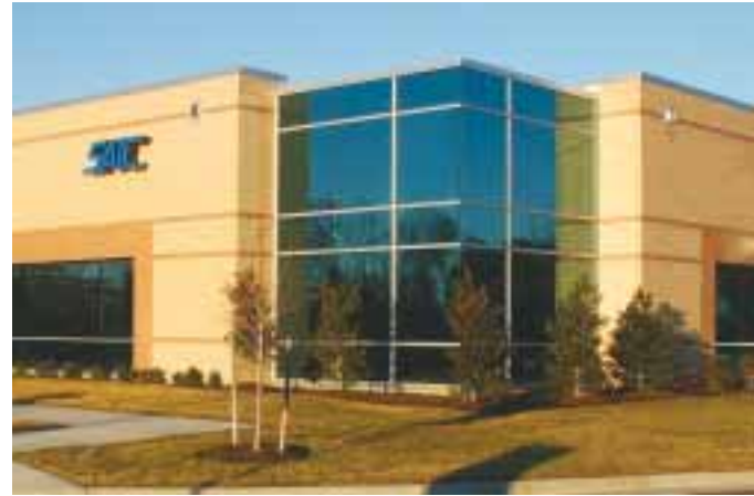
Science Applications International Corporation (SAIC), moved part of its Hampton Roads staff to this 23,000-square-foot office in Bridgeway Technology Center II to better serve its military customers.

Plans are underway for Bridgeway Technology Center III by building developer Continental Properties. It will be the third of six planned office buildings totaling more than one-half million square feet in Bridgeway Commerce Park.