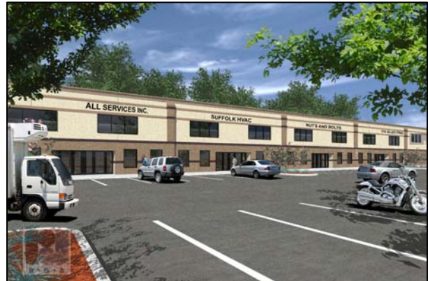
Building Rendering of the Suffolk Commerce Center