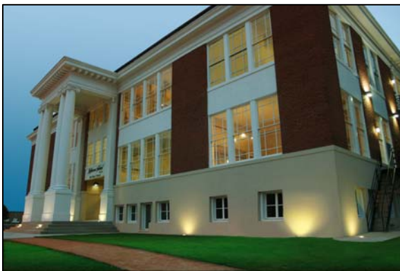
Jefferson School Lofts

For further information on the Jefferson School Lofts visit their website at www.tjlofts.com