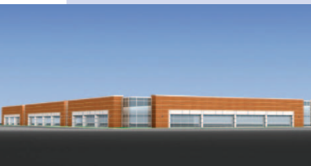
Above: Bridgeway Tech Center III.

The $11 million project will be known as Bridgeway Commerce Center II and III. The state-of-the-art light industrial buildings will complete the three-building, campus-like setting in Bridgeway Commerce Park.