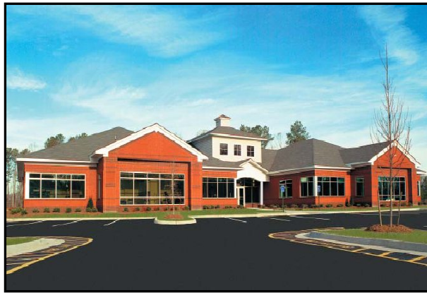
Harbour View Professional Center

For further information or to make an appointment, you can contact Adams Comprehensive Foot Care at 686-FOOT (3668). Appointments are available early morning and late evening for your convenience.